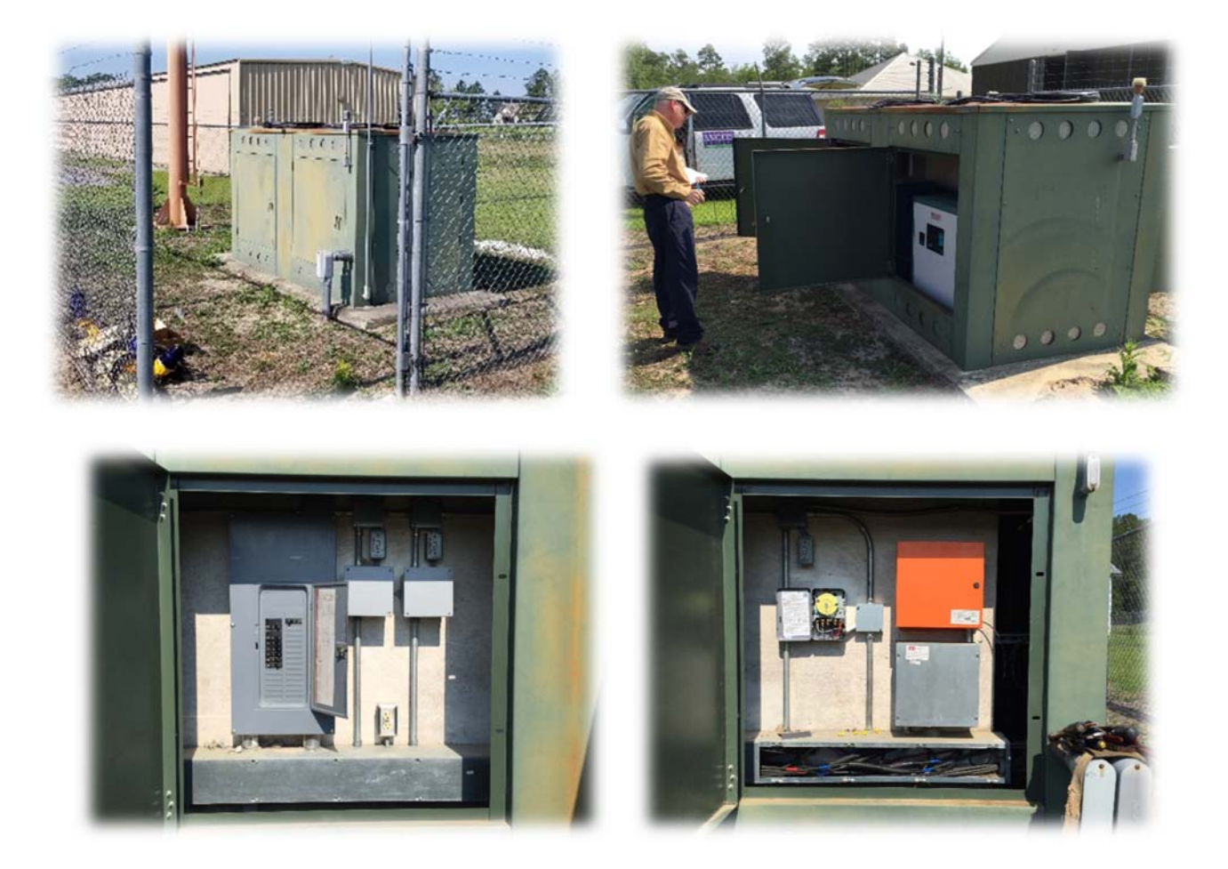
Figure 2: Airfield Lighting Enclosure (AFL Vault)

The Tri-County Airport(1JO) airfield lighting (AFL) enclosure, is located on the north side of the Airport Administration Building. See Figure 2 for photos of Airfield Lighting Enclosure.