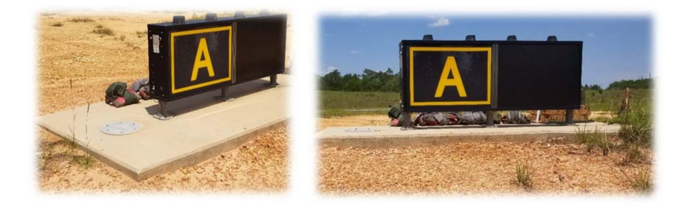
Figure 14: Sign Grade not in accordance with FAA EB 79