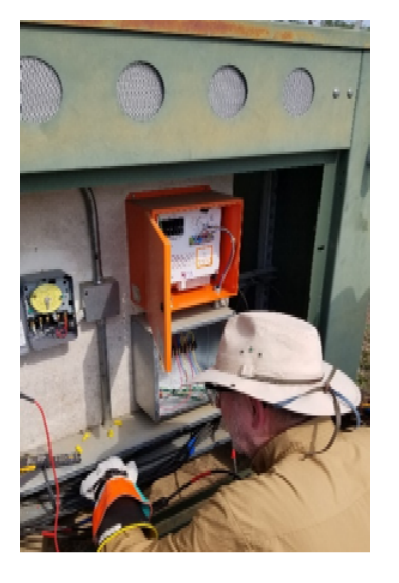
Figure 10: Pilot Control Lighting L-854 Radio Decoder