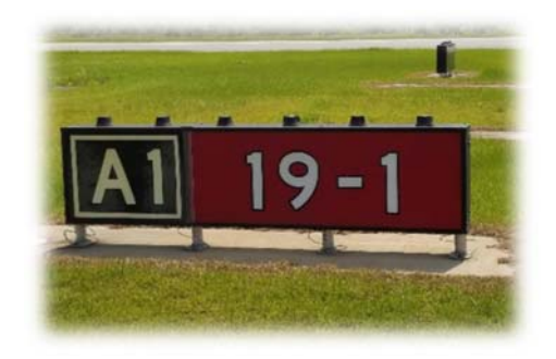
Figure 12: Taxiway Directional Sign and Mandatory Hold Sign