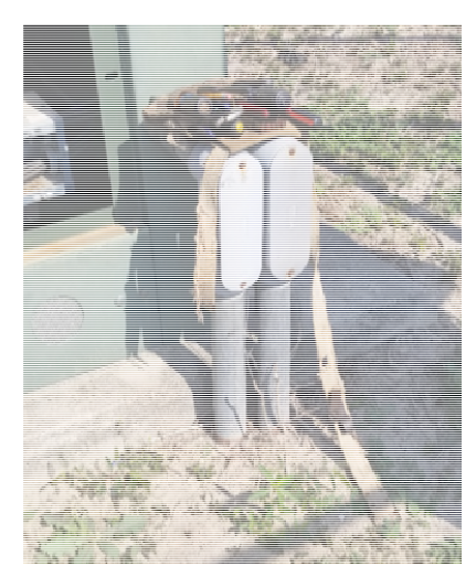
Figure 7: LB fittings

The interface with the field circuits occurs on the east wall of the enclosure through two LB fittings penetrating the enclosure wall as in Figure 7 . L-823 connector kits are located in the wire-way to allow disconnecting and shorting of the CCR/airfield lighting circuits for troubleshooting purposes as in Figure 8 . No SCO-1 cut outs are installed to safely disconnect the circuit from the airfield or short the regulator for testing as in Figure 9 .