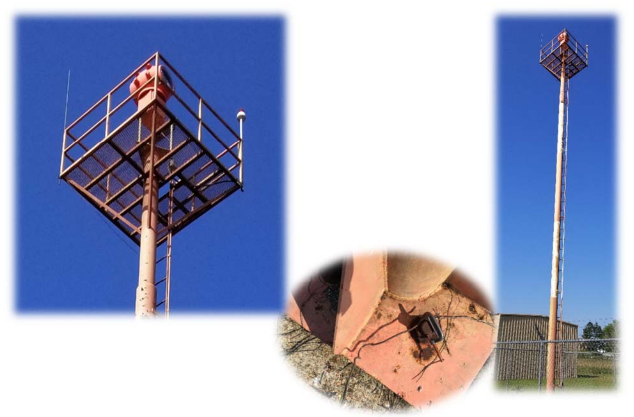
Figure 17: Airport Rotating Beacon and Tower

Short-term basic service/repair efforts may be completed to keep the existing beacon in working order until funding is available for a complete replacement. These recommended efforts include replacing the existing bulb with a longer-life, metal halide lamp; inspection/repair of the existing fall protection system; re-painting the existing beacon and pole; and various grounding improvements. Currently, the existing beacon pole has a strike termination device installed, but no visible grounding electrode. It is recommended to have a local grounding electrode installed and bonded to the beacon pole and the circuit equipment grounding conductor. It is further recommended that the lightning protection system on the beacon be inspected for compliance with NFPA 780.