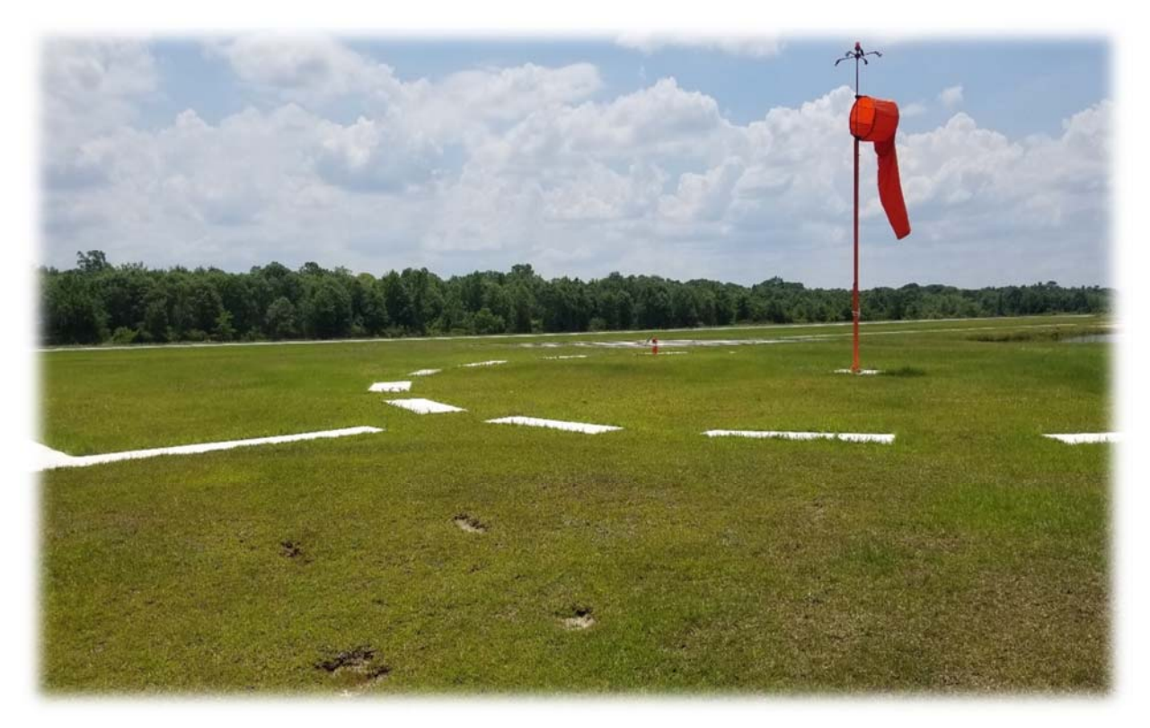
Figure 18: Existing L-807 Main Wind Cone with Segmented Circle (Centerfield)

The airfield does not have Supplemental windcones, L-806 frangible units, at either runway end.