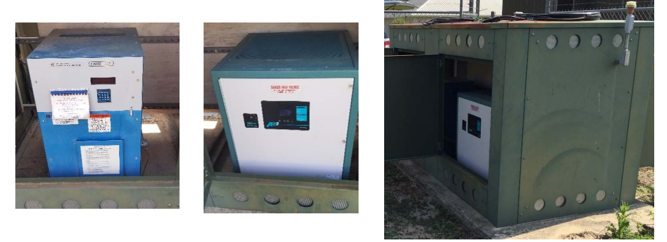
Figure 6: Existing Constant Current Regulators and Vault Enclosure

Both of the CCRs have a 6.6-ampere output and are sizes 7.5 kW and 15 kW. Both CCRs have three (3) brightness steps ( see Figure 6 ).