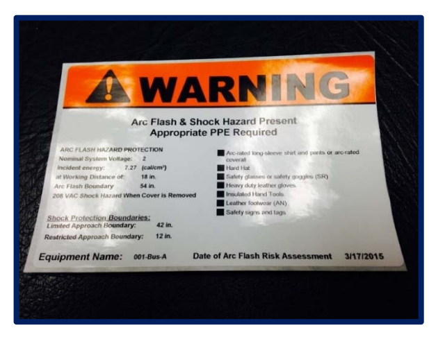
Figure 5: Generic Arc-Flash label

Also, please reference NFPA® 70, National Electrical Code, 2014 (NEC) Articles 110.21 and 110.24. (7) Appendix F