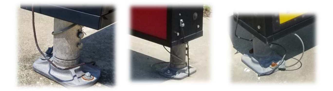
Figure 13: Sign Bonding to Ground Rod