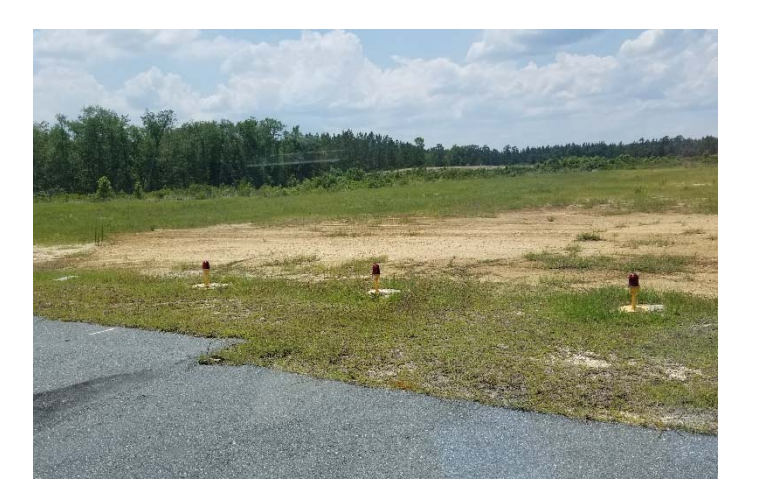
Figure 11: Runway Threshold Lighting