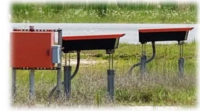
Figure 16: Runway 19 PAPI