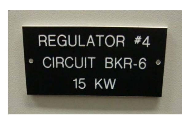
Figure 3: Typical Phenolic Nameplates on Main Disconnect and Regulator