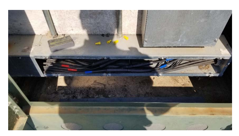
Figure 8: L-824 CCR Wireway