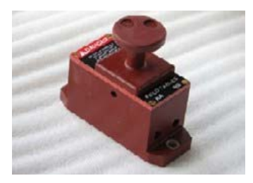
Figure 9: SCO Cutout Example